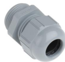
Plastic cable gland PG 13.5