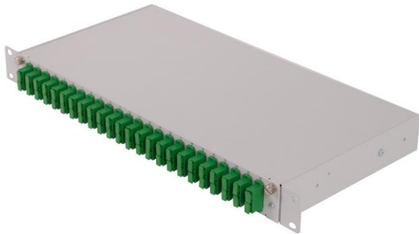
TMVJ-1U with FT-24-DSC Base unit with patch panel for 24x DSC adapters

The TMVJ Fixed Cabinet introduces a compact, low cost solution for fiber optic cable termination. The TMVJ series is ideal for rack-mounting in confined areas such as equipment enclosures where rack space is limited. The cabinet is equipped with slide-out shelf with splice tray holder. This allows easy access to the splicing area for optical network reconfiguration during operation and prevents damage to fibers prior to routing into adapters. The modular system allows splicing and termination up to 96 fibers in rack height 1U.