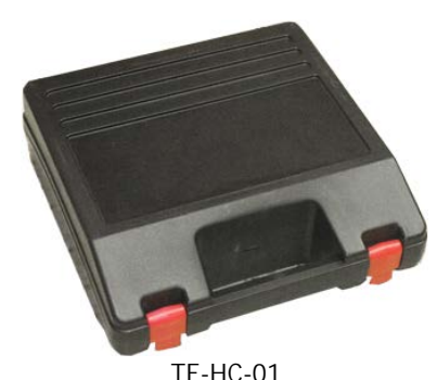
Hard carry case (265 x 270 x 90 mm)