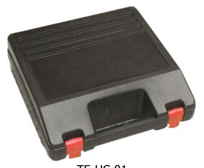
TE-HC-01 Hard carry case (265 x 270 x 90 mm)