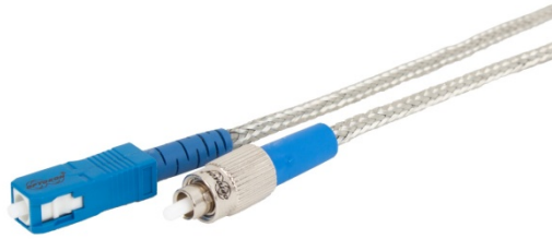
USC-AS SM-P-002 UPC-AS SM-P-002

The OPTOKON Shielded Fiber Optic Patchcord enables easy handling and installation in a similar way to standard electrical cable. This most recent version of the Shielded Fiber Optic Patchcord offers increased protection against the possibility of light leakage in order to eavesdrop on the signal while reducing the bending radius below the recommended limit. This unique design ensures an easier construction process therefore reducing the return loss and extending the life span of the optical fiber.