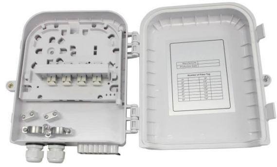
Opened MOTB-X30B-04-SC M