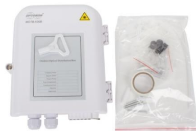
MOTB-X30B with standard accessories