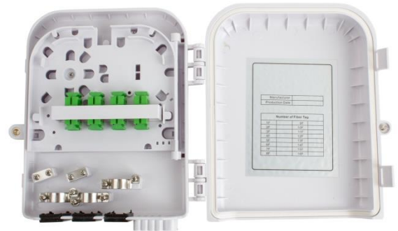
Opened MOTB-X30A-08-SC A