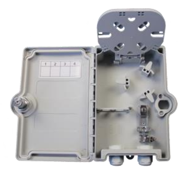
Opened MOTB-C01 termination box