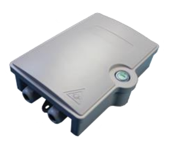
Closed MOTB-C01 termination box