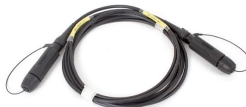
HMA Optical cable